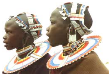
Projects Abroad Social event at lake Duluti Arusha Tanzania