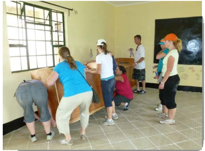
Two weeks Special Group- November 2011